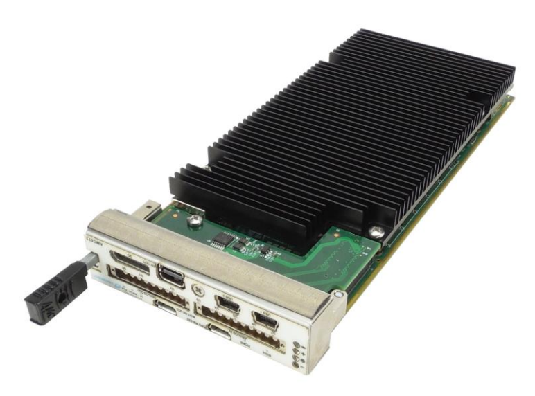
Figure 1: AMC573

The Module has onboard 64 GB of Flash, 128 MB of boot flash and an SD Card as an option.