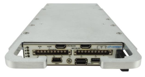
Figure 2: AMC573 Conduction Cooled