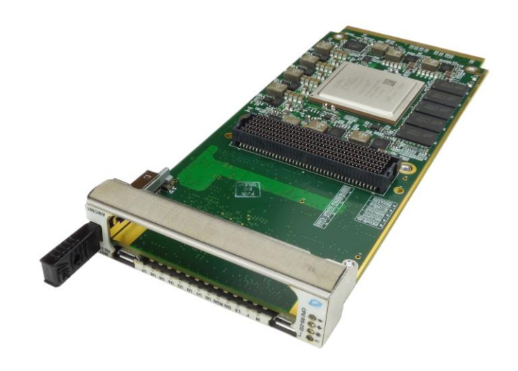
Figure 1: AMC581

The module has onboard 64 GB of Flash, 128 MB of Boot Flash and an SD Card as an option.