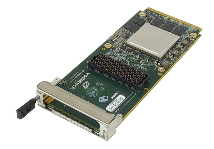
Figure 1: AMC582

The module has onboard 64 GB of Flash, 128 MB of boot flash and an SD Card as an option.