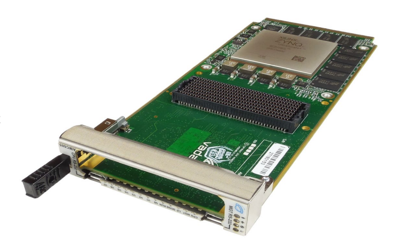
Figure 1: AMC585

The module has onboard 64 GB of Flash, 128 MB of boot flash and an SD Card as an option.