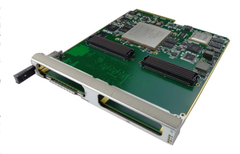
Figure 1: AMC593

The AMC593 has Serial Over LAN (SOL) per IPMI specification, with a hardware RNG for secure session.