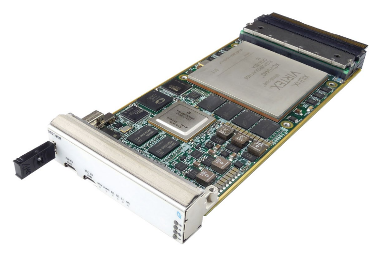
Figure 1: AMC596

The onboard quad core P2040 runs at 1.2 GHz with 1 GB of DDR3, 128 MB of Boot Flash, and a 32 GB SD Card. The PPC has x4 PCle interface to the FPGA in addition to its local bus. The PPC has its dual GbE routed to Ports 0 and 1 of the AMC via a mux to also allow FPGA routing to the Ports. The same applies to Ports 2-3 (PPC SATA Ports or directly to the FPGA via mux selection).