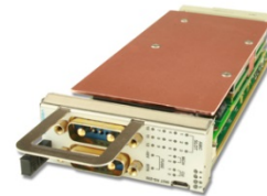
UTC020 Power Module