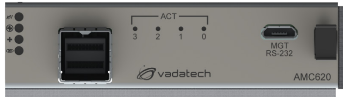
Figure 2: Front Panel