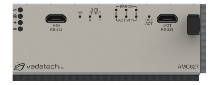
Figure 2: Front Panel