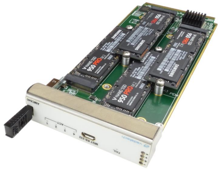
Figure 1: AMC640

The AMC640 is available in both air-cooled (MTCA.0 and MTCA.1) and rugged conduction-cooled versions (MTCA.2 or MTCA.3), contact sales for details.