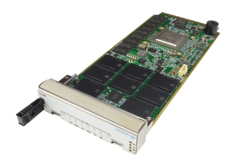
Figure 1: AMC645

The AMC645 is available in both air-cooled (MTCA.0 and MTCA.1) and rugged conduction-cooled versions (MTCA.2 or MTCA.3, contact sales for details).