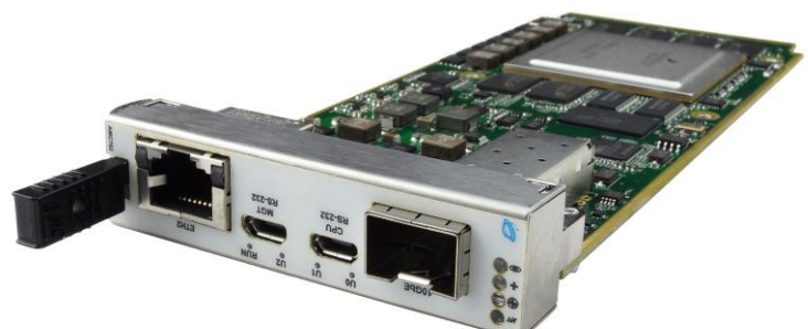
Figure 1: AMC702

The AMC702 provides dual GbE to the rear per AMC.2 specification on Ports 0 and 1. It has single GbE to the front. The module also provides SRIO 2.0 on Ports 4-7 and 8-11.