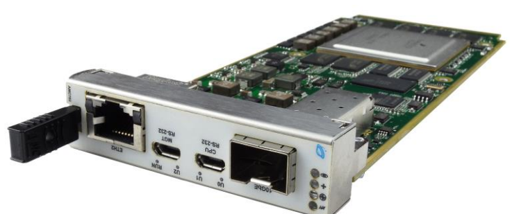
Figure 1: AMC703

The AMC703 provides dual GbE to the rear per AMC.2 specification on Ports 0 and 1, and single GbE to the front panel. The module supports SATA on Ports 2 and 3 and also provides PCIe on Ports 4-7 and 8-11.