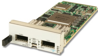
AMC534 100G FPGA