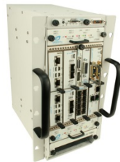
VT899 7U Chassis Cube