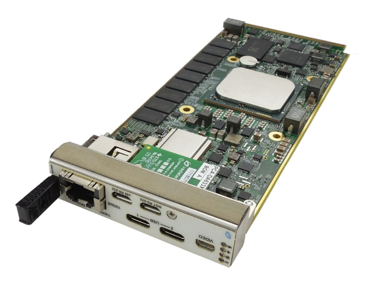
Figure 1: AMC752

Linux OS is standard on the AMC752, consult VadaTech for other options.