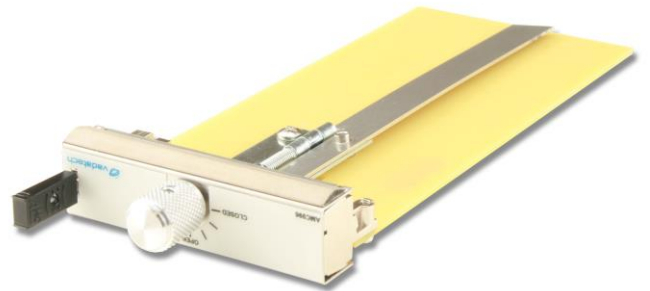
Figure 1: AMC996

The AMC996 is a filler panel for single or double module slots. The control dial is used to regulate the airflow baffle angle in conjunction with air flow analysis.