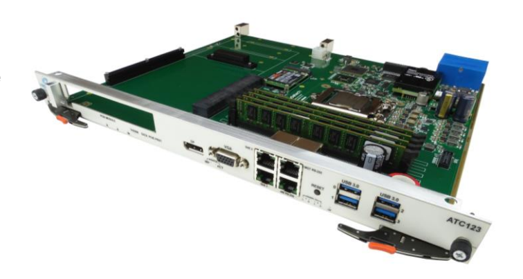
Figure 1: ATC123

The ATC123 can accommodate a dual width PCle module with the dual width ATCA front panel option, expanding the board pitch from 1.2" to 2.4".