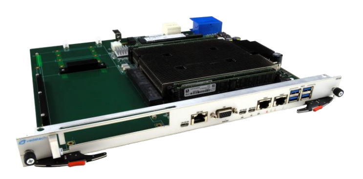
Figure 1: ATC125

The ATC125 can accommodate a dual width PCIe module with the dual width ATCA front panel option, expanding the board pitch from 1.2" to 2.4".