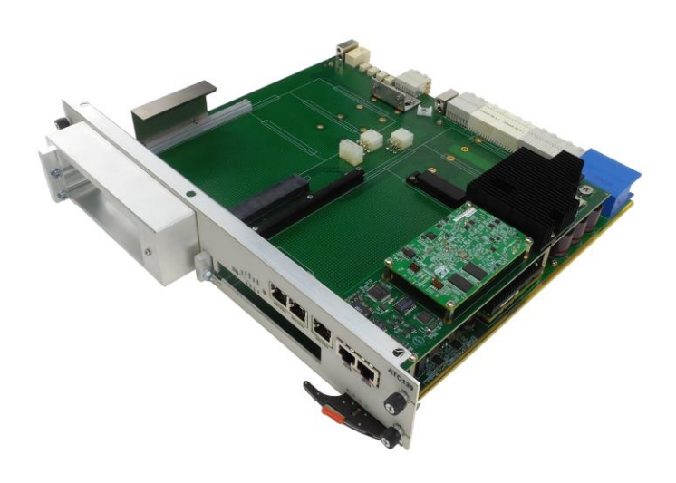
Figure 1: ATC130

The ATC130 can be ruggedized for harsh environments. See customer ordering options for conformal coating.