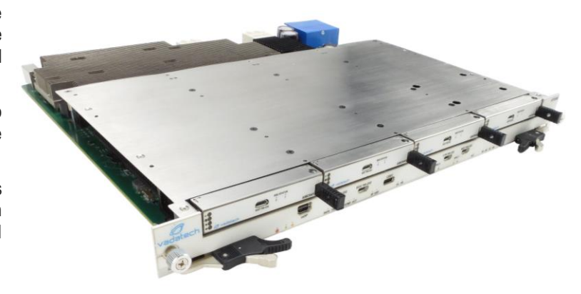
Figure 1: ATC605

The ATC605 implements IPMI 2.0 for its management and payload.