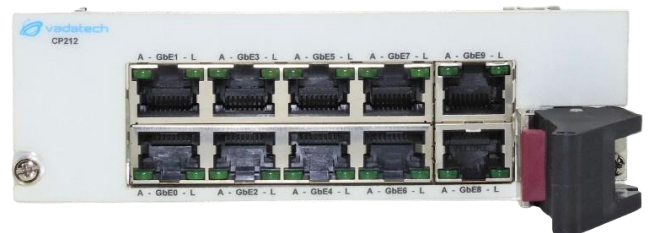
Figure 3: CP212 Front Panel View