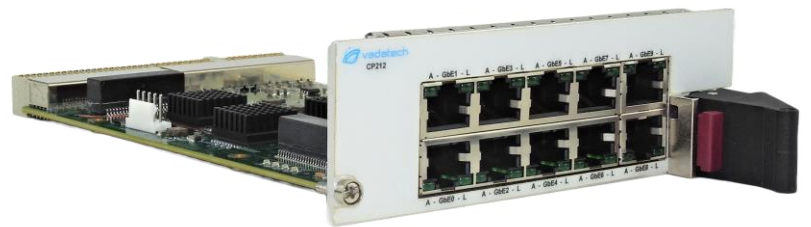
Figure 2: CP212