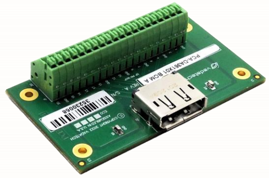
Figure 1: DA361