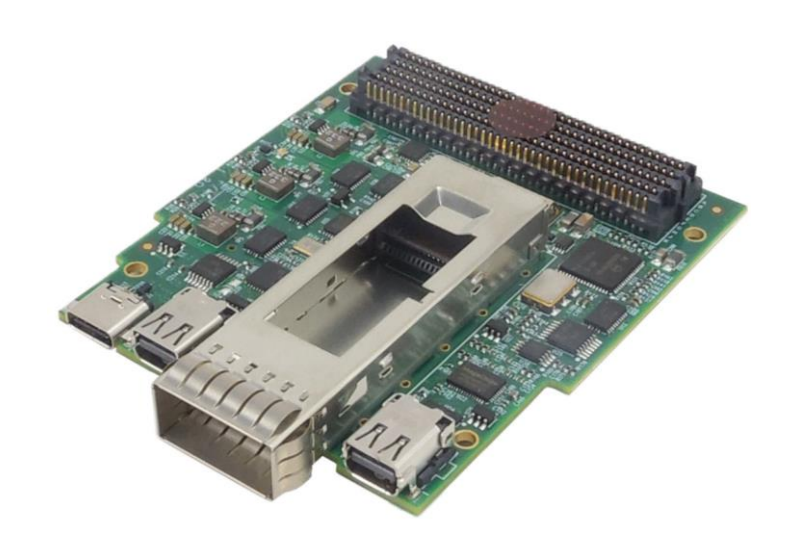
Figure 1: FMC110

The FMC110 has a low jitter PLL (Jitter performance <100fs typical) to provide clocks. The PLL can generate clocks up to 800 MHz. The input clocks to PLL can range from 8 KHz to 750 MHz.