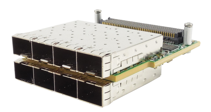
Figure 1: FMC116 (mounted on VPX)

Note: VadaTech can supply a custom front panel to fit any of our FMC carriers. VPX module (10 HP panel) or AMC module (8 HP panel).