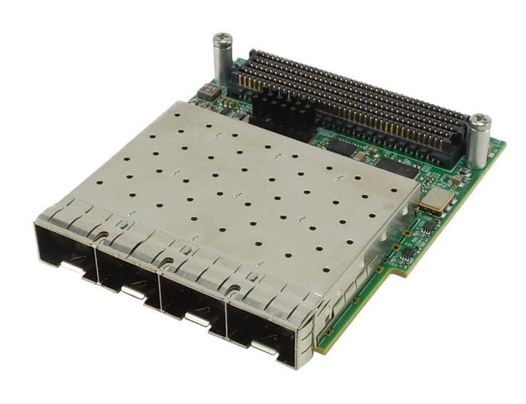
Figure 1: FMC117

The FMC117 panel must be integrated as a monolithic panel with the carriers such as AMC, VPX, etc. The FMC117 does NOT come with an FMC panel.