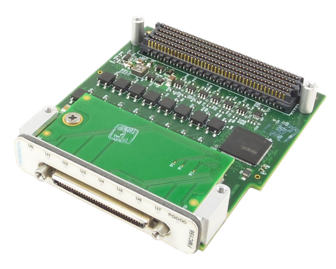
Figure 1: FMC156

The FMC156 can provide power of up to 12W to an external module.