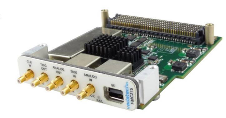
Figure 1: FMC215

The FMC215 has a trigger input which is routed to the FMC connector as well as to the ADC. The analog input/output, clock input and trigger inputs are routed via SSMC connectors.