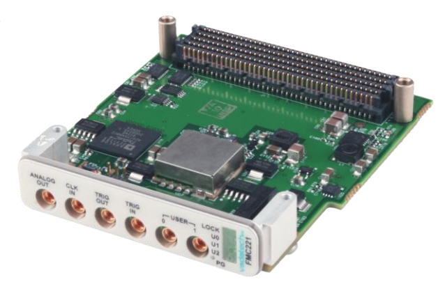
Figure 1: FMC221

Module provides a Clock input so the sampling rate could be synchronized to an external device. It also provides TRIG IN/OUT with two GPIO.