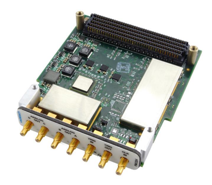
Figure 1: FMC224

The module has a wide-band PLL which can take its reference clock via the front panel, FMC Carrier or the onboard reference. The unit also allows the RF Clock syntheses to be generated by the onboard wide-band PLL or the front panel.