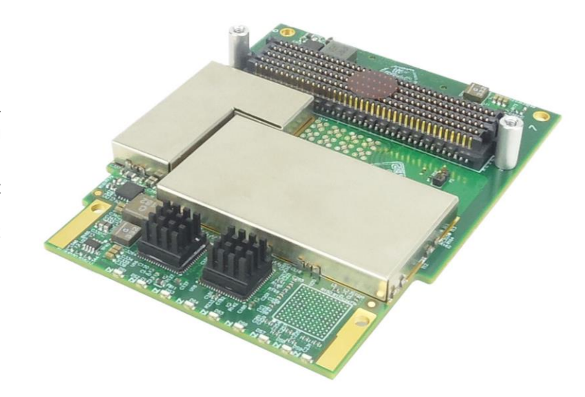
Figure 1: FMC233

All I/O are mounted on the back side of the FMC to allow an RF front end module to be mounted to the carrier. This allows a full integrated RF front end with the FMC on a single module. Please contact VadaTech Sales for the detail specification.