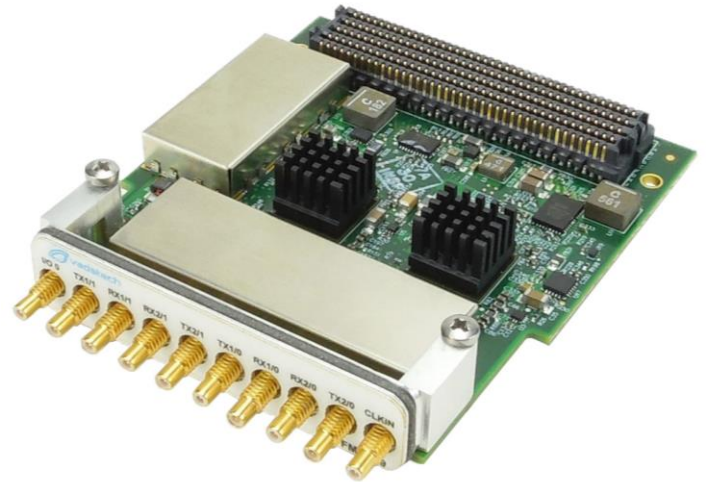
Figure 1: FMC239

The VadaTech family of Multiple Input Multiple Output (MIMO) modules are the most versatile FMCs of this type on the market.