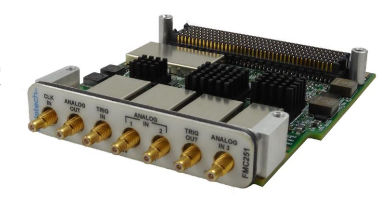
Figure 1: FMC251

The module has a Trigger Input/Output, clock and all analog Input/Output via SSMC connectors.