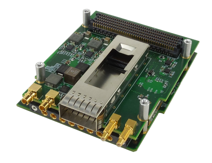
Figure 1: FMC256

The Module does not follow the VITA57 height constrain. It has an additional Daughter card that mates to the FMC module to allow it to accommodate the ADC/DAC channels. For example, on the AMC FPGA FMC Carriers, it requires a full-height AMC panel to accommodate all the I/Os. The Carrier must have a monolithic panel (the FMC256 does not come with an FMC panel) to cover the FMC256 I/O envelope