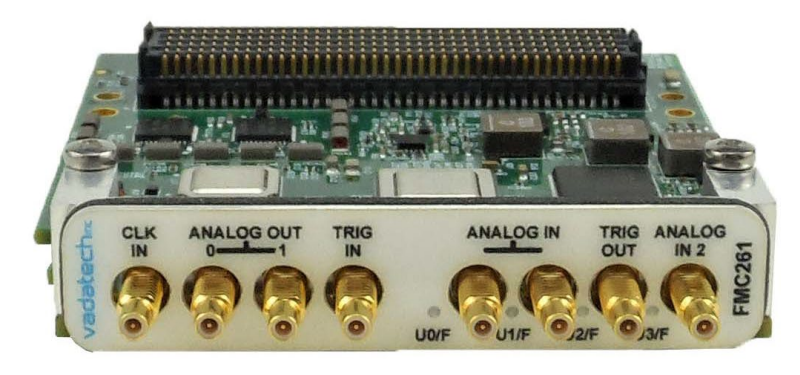
Figure 3: FMC261 Front Panel