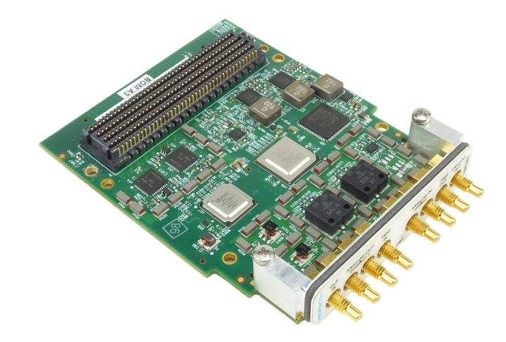
Figure 1: FMC261

The FMC261 has an option for additional I/O through a Daughter Card (DA850) which mates to the FMC261 to provide 2 x 22 single ended output and 2 x input via two 3M connectors. The DA850 can take +12V and provide the +12V out to the I/O connectors. Note, with the DA850 installed the module violates the FMC height specification. VadaTech VPX/AMC/PCle carriers can accommodate this by modifying the front panel of the carrier as monolithic. Please contact VadaTech Sales for further information.