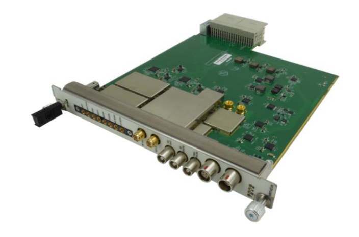
Figure 1: MRT523B

VadaTech offers a wide range of MicroTCA.4 products, including full systems. Contact your local salesperson or representative for details.