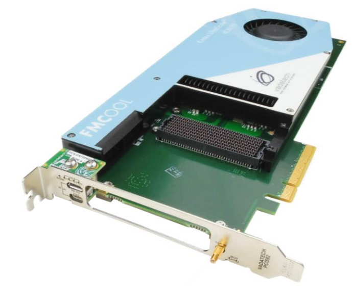
Figure 1: PCI592

PCI592 provides active cooling of the FPGA and FMC+ (the module does not support HSPCe connector) making it appropriate for power-hungry applications or those requiring temperature stability for good performance.