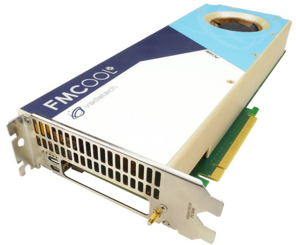
Figure 1: PCI596

Active cooling of the FPGA and FMC+ (the module does support HSPCe connector) is provided, making it appropriate for power-hungry applications or those requiring temperature stability for good performance.