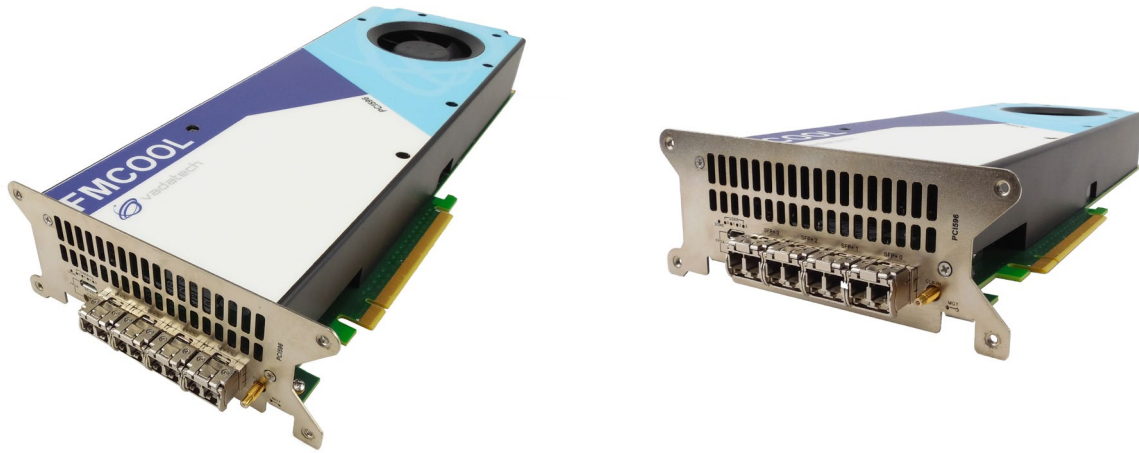
Figure 2: PCI596 w/ the FMC109 installed