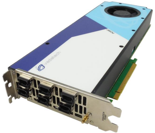
Figure 1: PCI597

In addition, 16 uncommitted connection pairs are routed to a dual x8 expansion connector, providing direct connectivity to a neighbouring FPGA (e.g. via Aurora, 10/40GbE, SRIO, PCIe) without the need to go through the host.