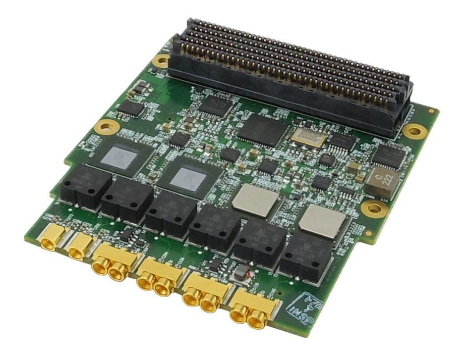
Figure 1: SOF200