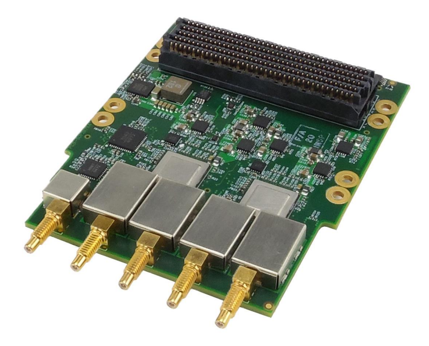
Figure 1: SOF207