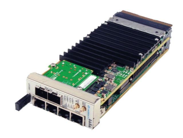
Figure 1: UTC002

The UTC002 has sophisticated clocking features. It has options for Telecom, GPS and/or Fabric clocks. Stratum-3 TCXO and VCTCXO is the default configuration. The board has a user-selectable option for protocol analyzer mode.