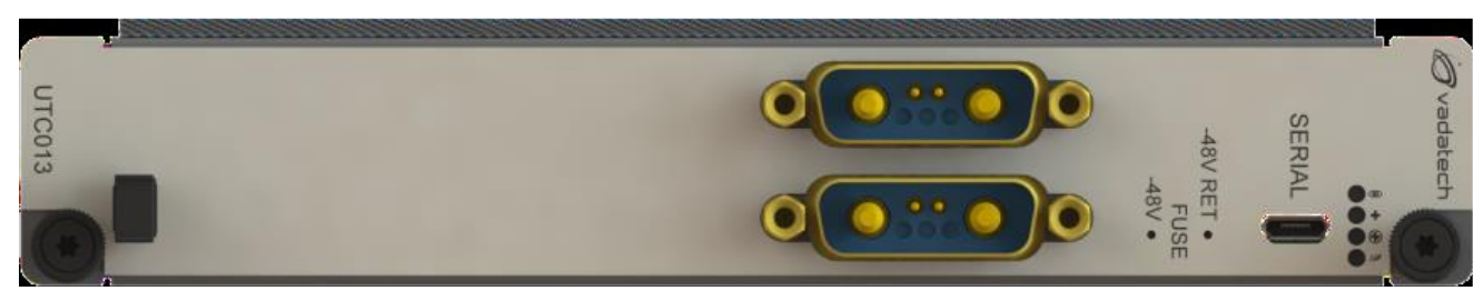
Figure 3: UTC013 Front Panel