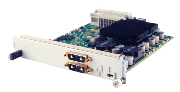
Figure 1: UTC013

The UTC013 is IPMI 2.0 and HPM.1 compliant with optional IPMI commands including warm/cold reset, re-arm sensor events, get device GUID, and get/set the hysteresis, threshold, and/or sensor event enable. The PMs follow the ATCA specification in fail-over for redundant IPMB-0 and FRU LED control. The units also have power channel control, get power channel status, PM reset, get PM status, and PM heartbeat. Temperature and current sensors are also included