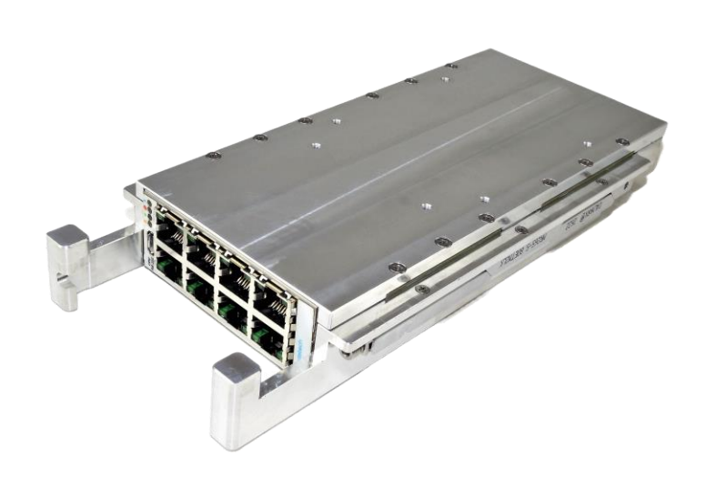
Figure 2: UTC043 Conduction Cooled