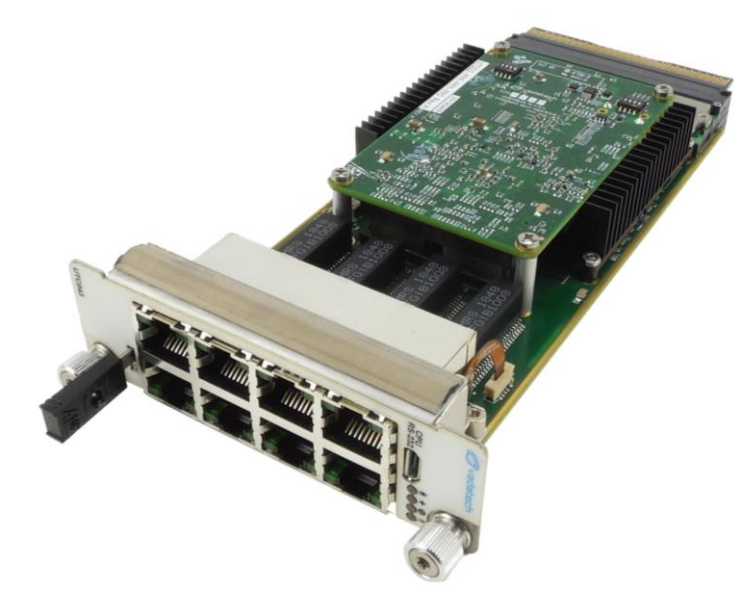
Figure 1: UTC043

The UTC043 runs Linux on its MCMC Quad Core ARM Freescale processor @ 1 GHz per core and is hot-swappable. It is fully redundant when used in conjunction with a second instance of the module. The firmware is HPM.2 compliant enabling easy upgrades.