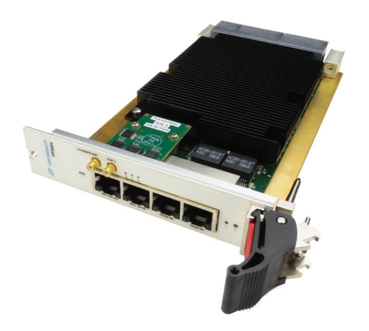
Figure 1: VPX008

The VPX008 has advanced clocking features including grand master clock and high-quality clock distribution/synthesis.