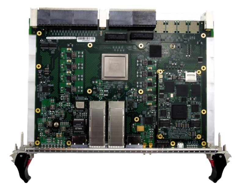
Figure 2: VPX011 Top View