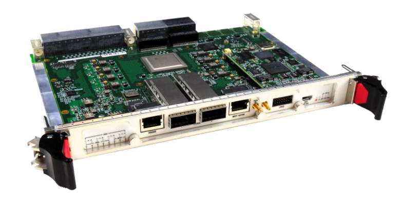
Figure 1: VPX011

The VPX011 has advanced clocking features including high-quality clock distribution/synthesis to the two VPX P0 clocks across the backplane.