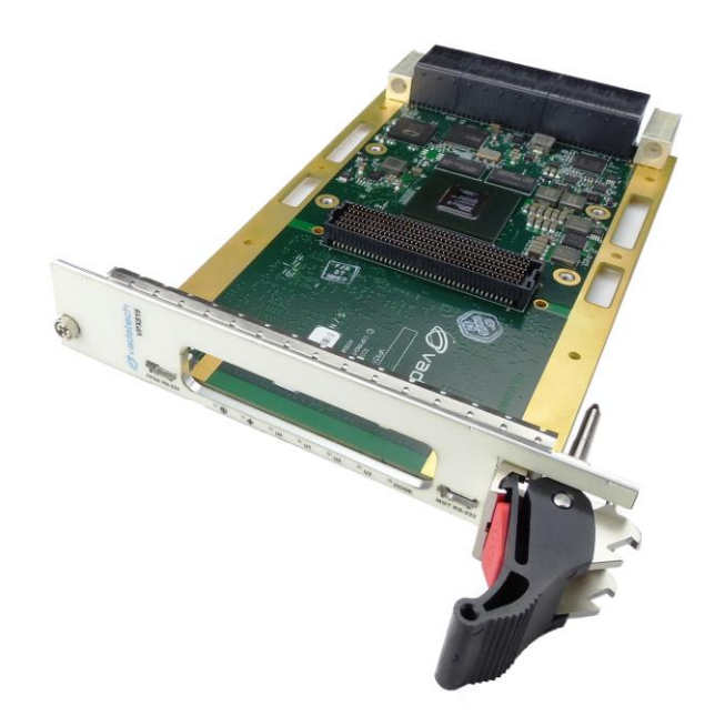
Figure 1: VPX519

Please contact VadaTech for details of Conduction Cooled versions.