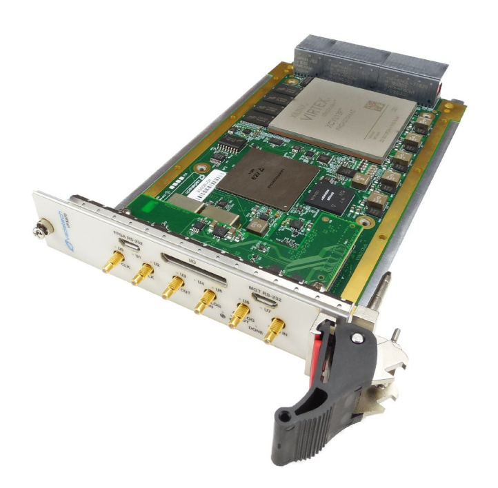
Figure 1: VPX570

VadaTech's Multi-Path Modulation software package can provide an additional FPGA image and source code for the VPX570, See Datasheet MPM_VPX570 and Video MPM570 Development Accelerator for details.