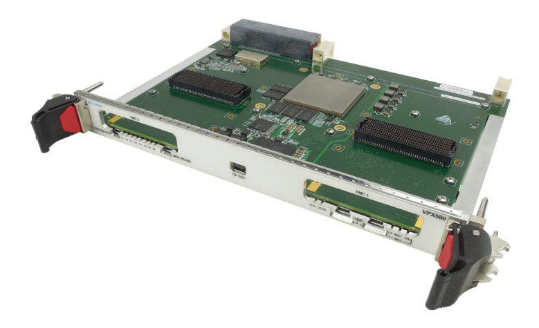
Figure 1: VPX580

Onboard microcontroller implements Tier 2 health management.