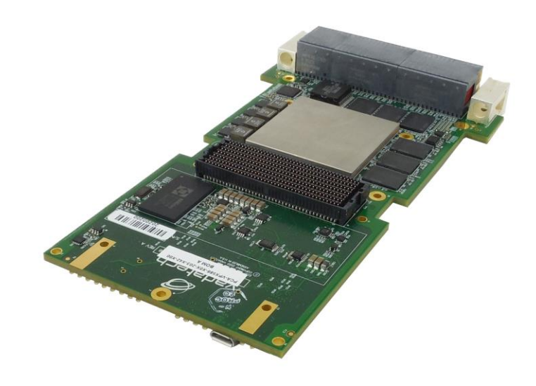
Figure 1: VPX586

The module has onboard 64 GB of Flash, 128 MB of boot flash and an SD Card as an option.