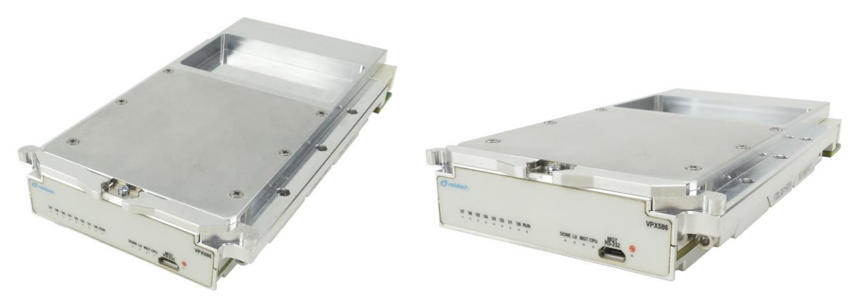
Figure 2: VPX586 w/ heat sink