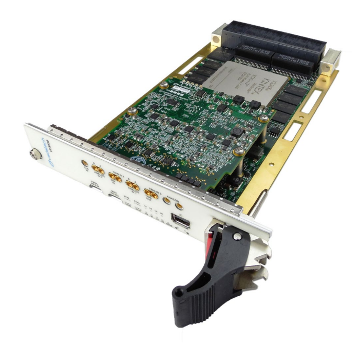
Figure 1: VPX599A

Note: The difference between the VPX599 and VPX599A is I/O routing to the P1/P2 connector of the VPX otherwise the hoards are identical