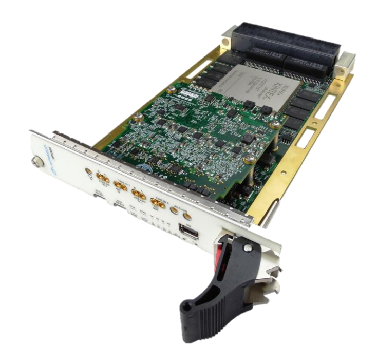
Figure 1: VPX599

Please contact VadaTech for details of Conduction Cooled versions.